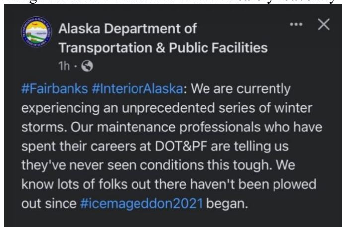
December 2021 Facebook Post.